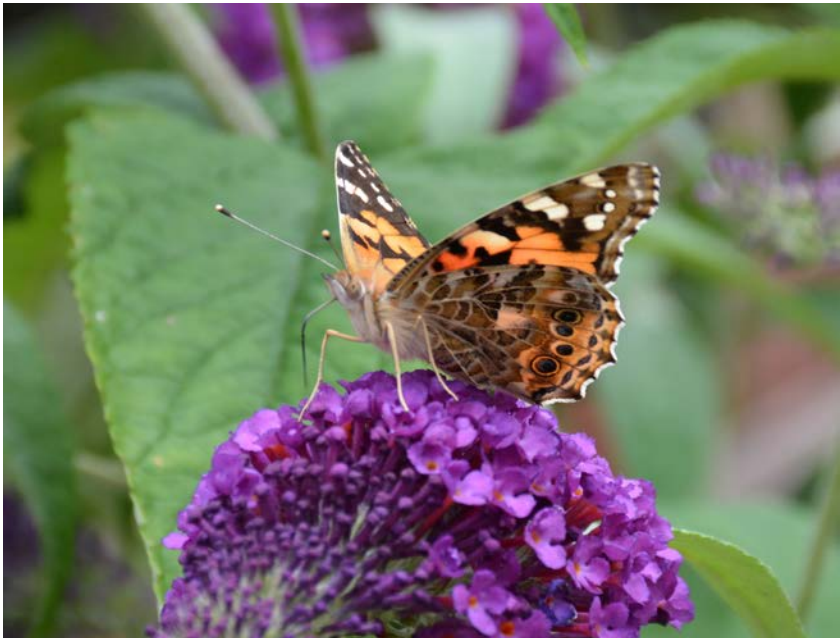
A Painted Lady (on buddleia)