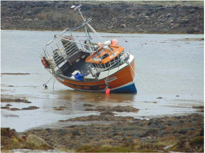
Tiree – waiting for the tide