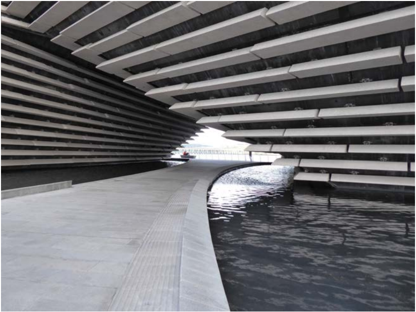
V & A Museum, Dundee